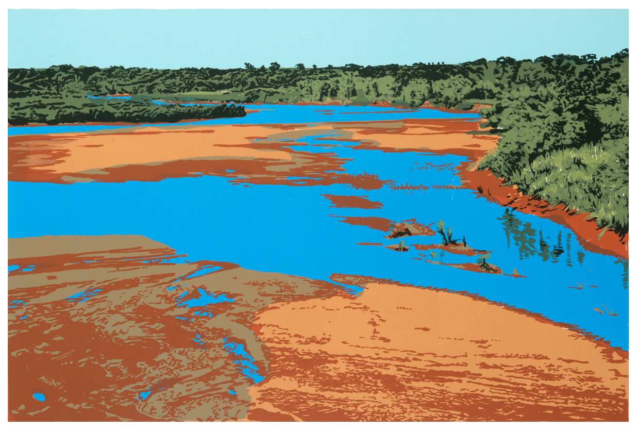
ABOVE: OKLAHOMA LANDSCAPE: CIMARRON, 2016, HAND-PULLED SERIGRAPH, 22 X 30 INCHES. BELOW: PROCESS SKETCH.