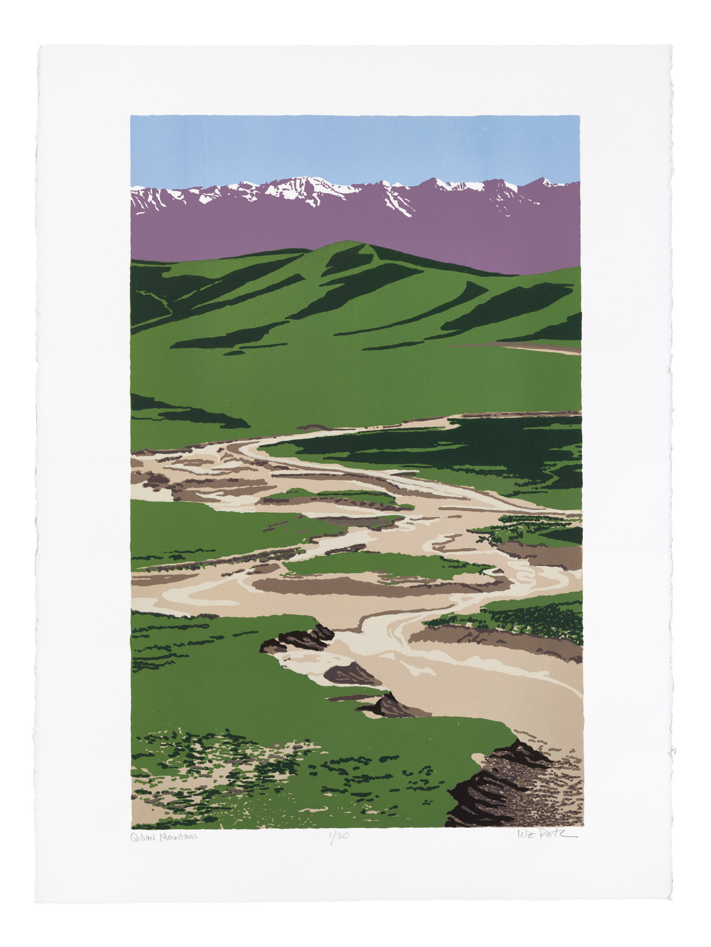
"Roth understands place not only through her research and travels, but also through the process of creating art."