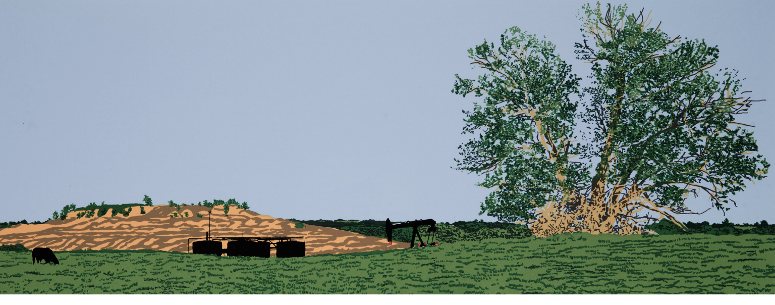
CLOCKWISE FROM TOP: LOGAN COUNTY, OKLAHOMA, 2018, SCREEN PRINT, 16 X 39 1/2 INCHES. | PROCESS SKETCHES FOR LOGAN COUNTY, OKLAHOMA AND FLARE. | FLARE, 2018, SCREEN PRINT, 30 X 22 INCHES. CENTER: PROCESS SKETCH. FAR RIGHT: QILIAN, 2019, SCREEN PRINT, 22 X 30 INCHES.