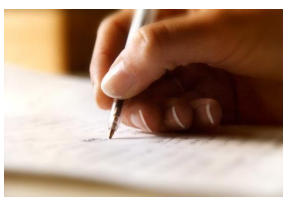
5 - Writing about photography? Here are some tips from Duke University. <sup>5</sup>

4 - Strengthen your Visual Literacy skills and deepen your understanding with this handy worksheet for Analyzing Photography.