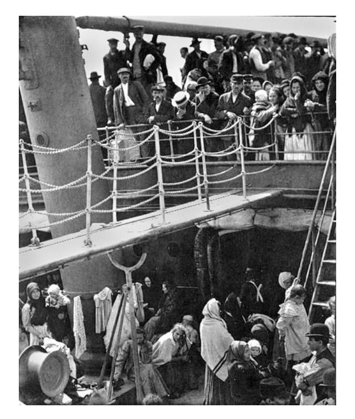
3 - Learn more about Alfred Stieglitz thoughts when taking the famous photography, Steerage. <sup>3</sup>