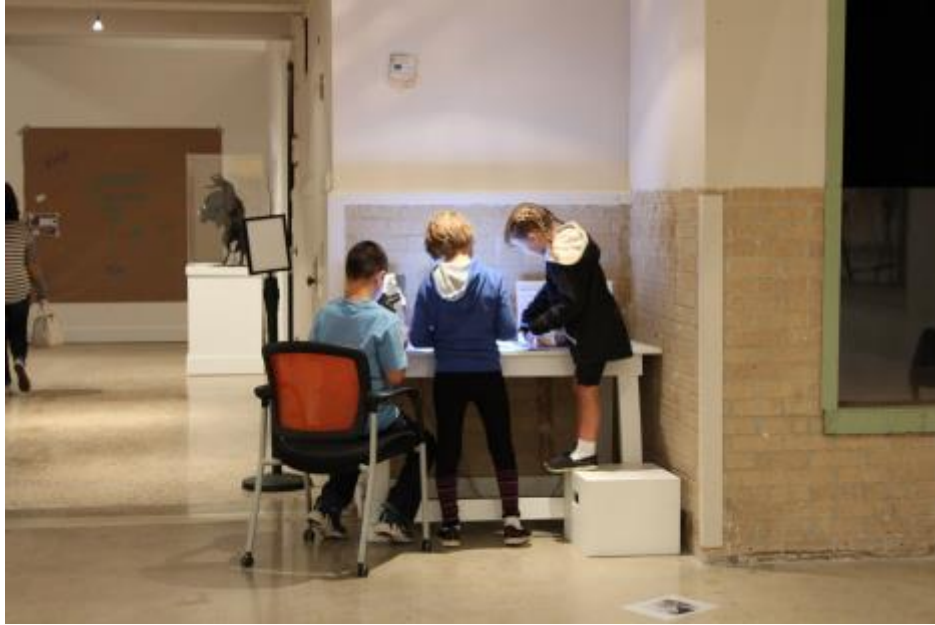
9 - Some young visitors creating collages using the light table and transparent objects.