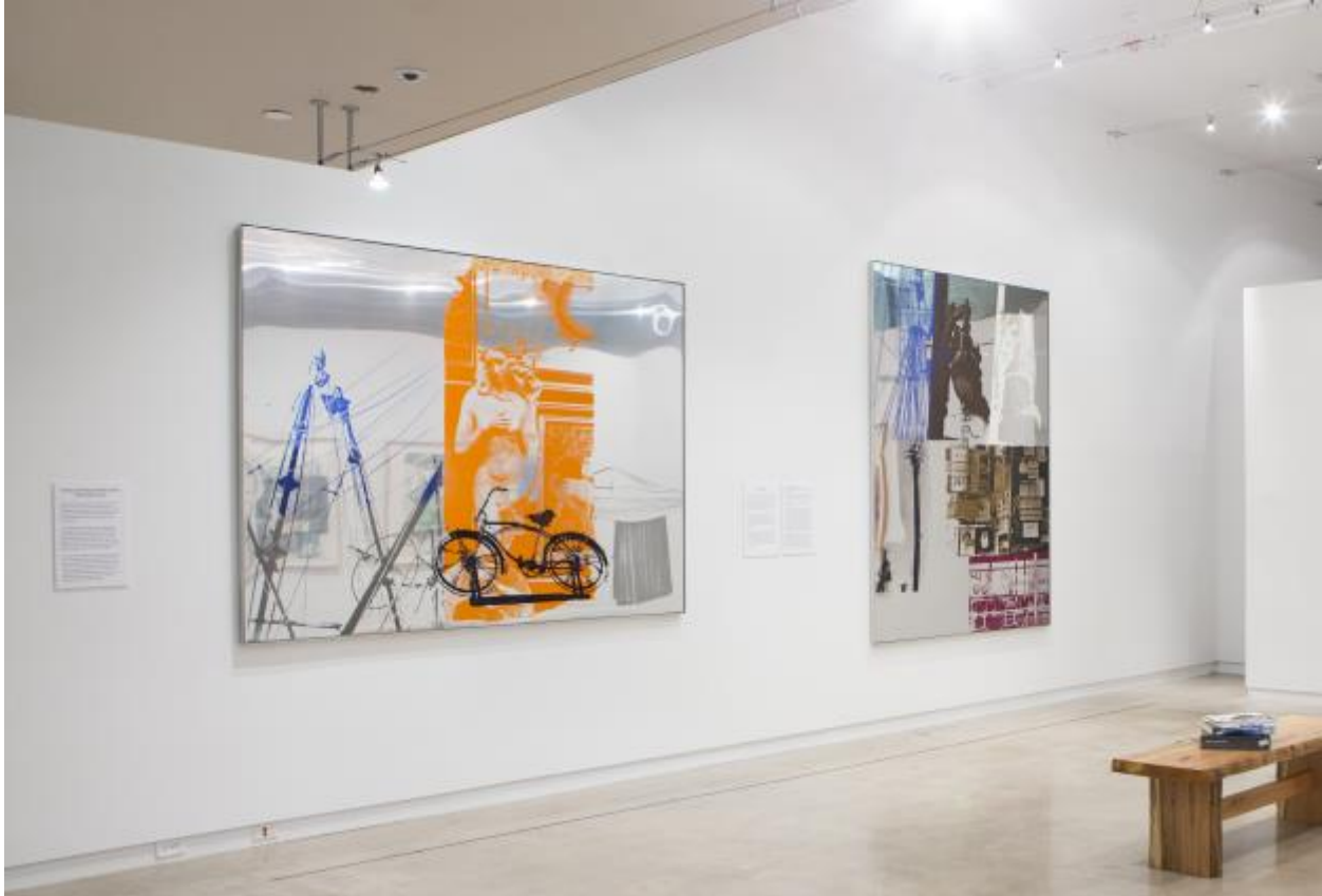
1 - Robert Rauschenberg's World from the series New Friends, Old Friends: Works from the Collection on view at the Oklahoma State University Museum of Art January 24, 2017, to June 10, 2017.