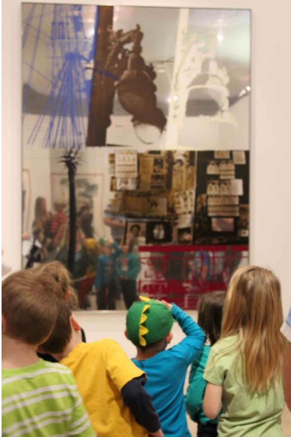
8 - Homeschool students creating a Shared Story while viewing Narcissus / ROCI USA (Wax Fire works).