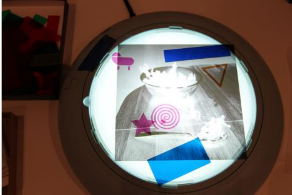
11 - Using a light table, film negatives, and transparencies, visitors created their own layered compositions.