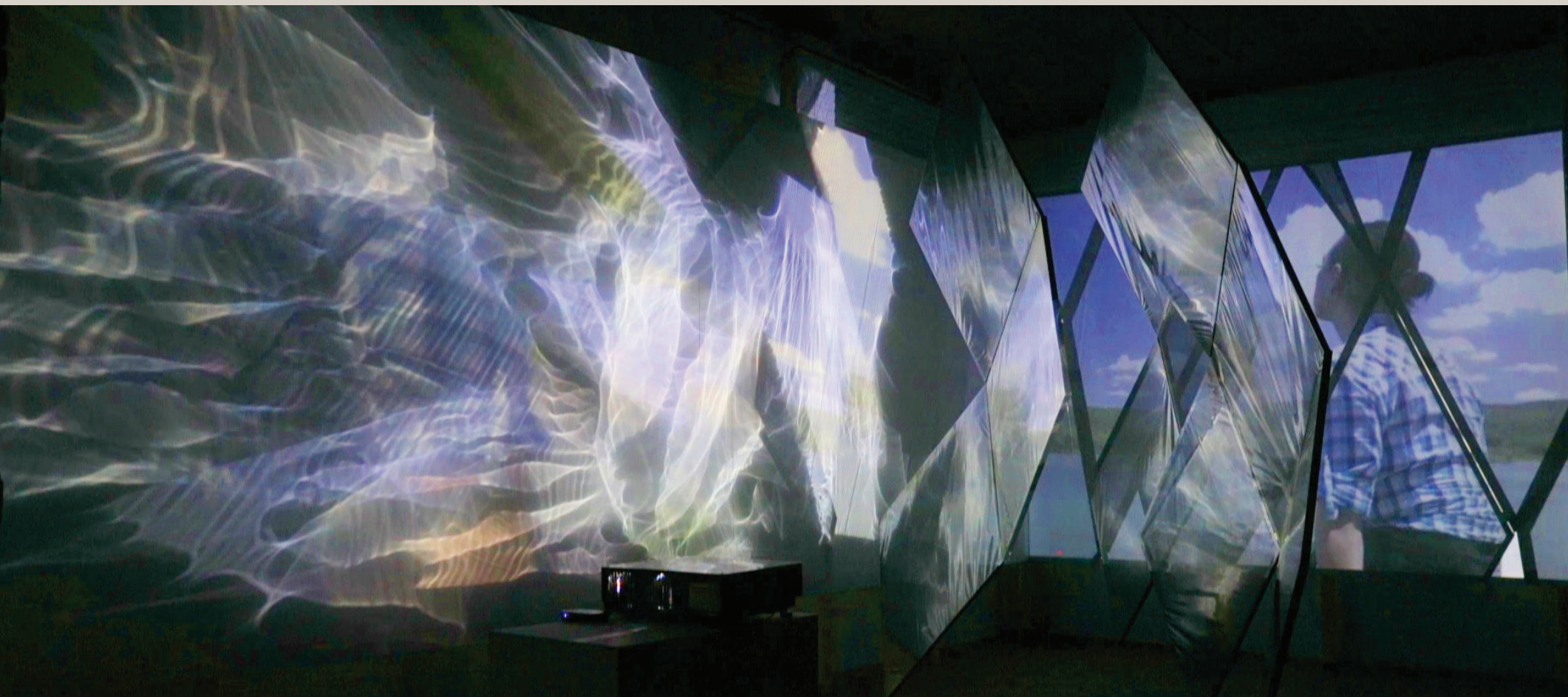
Nick Vaughan and Jake Margolin, 50 States: Oklahoma , 2016, 25-minute video loop, two-way mirror film, and wood, 10 x 15 x 30 feet. Courtesy the artists.

COVER: Nick Vaughan and Jake Margolin, Lynn Riggs (3 Layers) from Oklahoma, 50 States series, 2016, 29 x 39 x 5 1/2 inches, hand-cut, found road maps. Courtesy the artists.